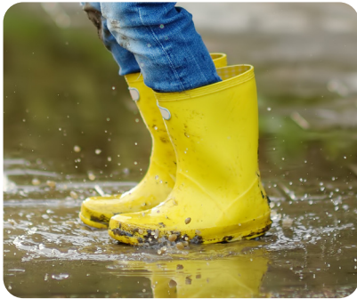
Rubber wellies are waterproof and bendy.