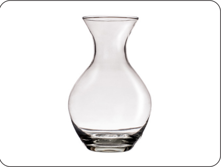
This vase is made from glass.

Materials are what objects are made from. Examples of materials include glass, wood, fabric, plastic, stone and metal. Materials are all around us, such as in the home, garden, school and park. They are important because we use materials to make the objects we use every day.