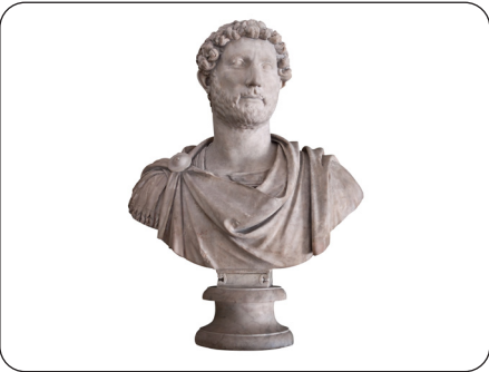
This statue is made from stone.