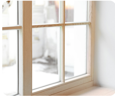
A glass window is hard and transparent.