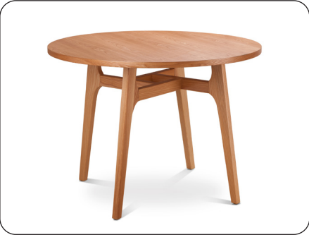
This table is made from wood.