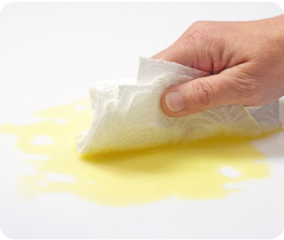
A paper kitchen towel is soft and absorbent.

A property is a quality that a material has. Materials can be described by their properties, such as hard, soft, stretchy, bendy, transparent and waterproof. Materials have different properties, which make them suitable for making different objects.