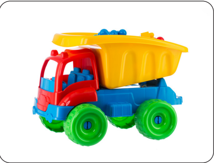
This toy is made from plastic.