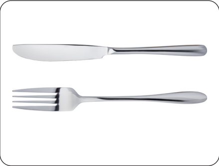
This cutlery is made from metal.