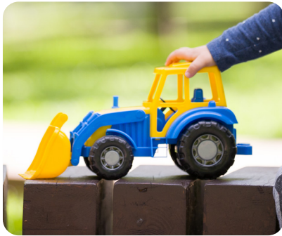
A plastic toy is hard and smooth.