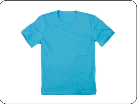
This T-shirt is made from fabric.