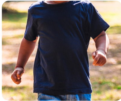
A cotton T-shirt is soft and stretchy.