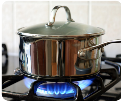
A metal pan is smooth and shiny.