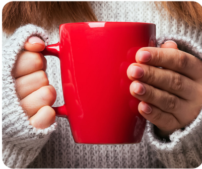
A ceramic mug is hard and waterproof.