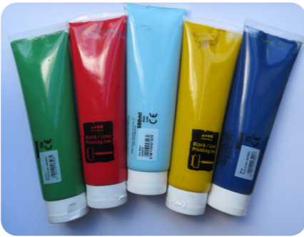
coloured printing inks