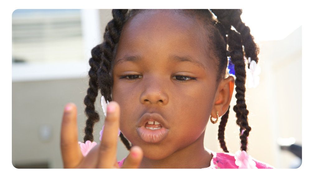
Nursery rhymes can help children learn new skills, like counting.

Nursery rhymes use rhyming words to make them easier to learn and remember.