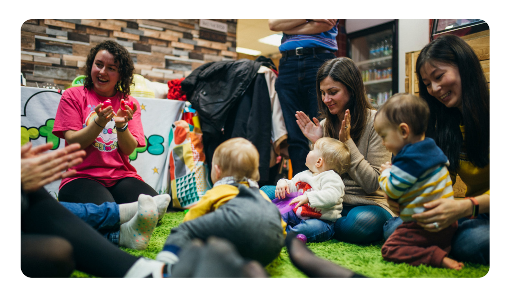
Nursery rhymes are traditional children's songs or rhymes.