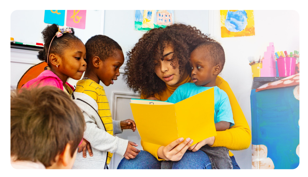
Fairy tales are traditional children's stories.

Read these interesting facts about stories and rhymes with a parent, carer or teacher.